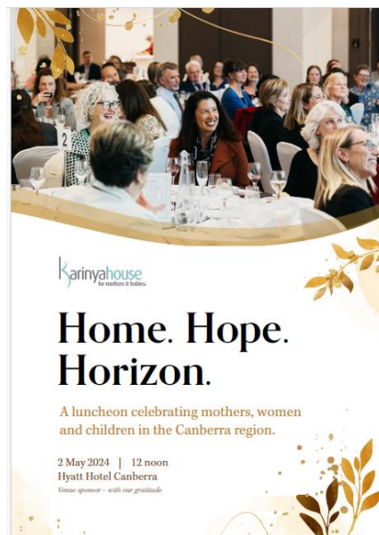
2 May 2024– Home. Hope. Horizon. A Charity Luncheon celebrating Mothers, Women and Children in our Canberra Region

We look forward to welcoming you all to participate in these events over the coming months, with more details available on our website as they come to hand.