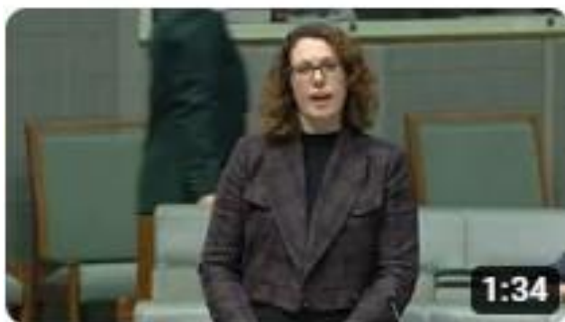
31 July 2023 - visit to Karinya House